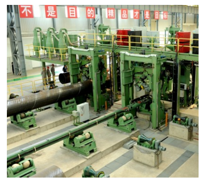
Brand new pipe manufacturing machineries in Zhongyou BSS's plant