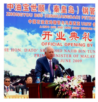
Official opening of Zhongyou BSS by Malaysia's Prime Minister