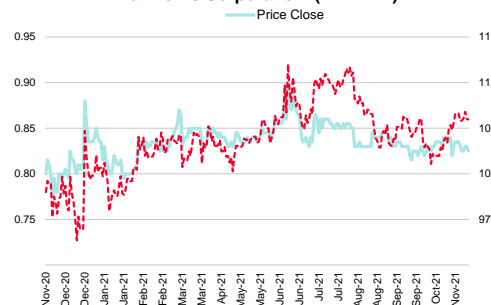
Taliworks Corporation (TWK MK)