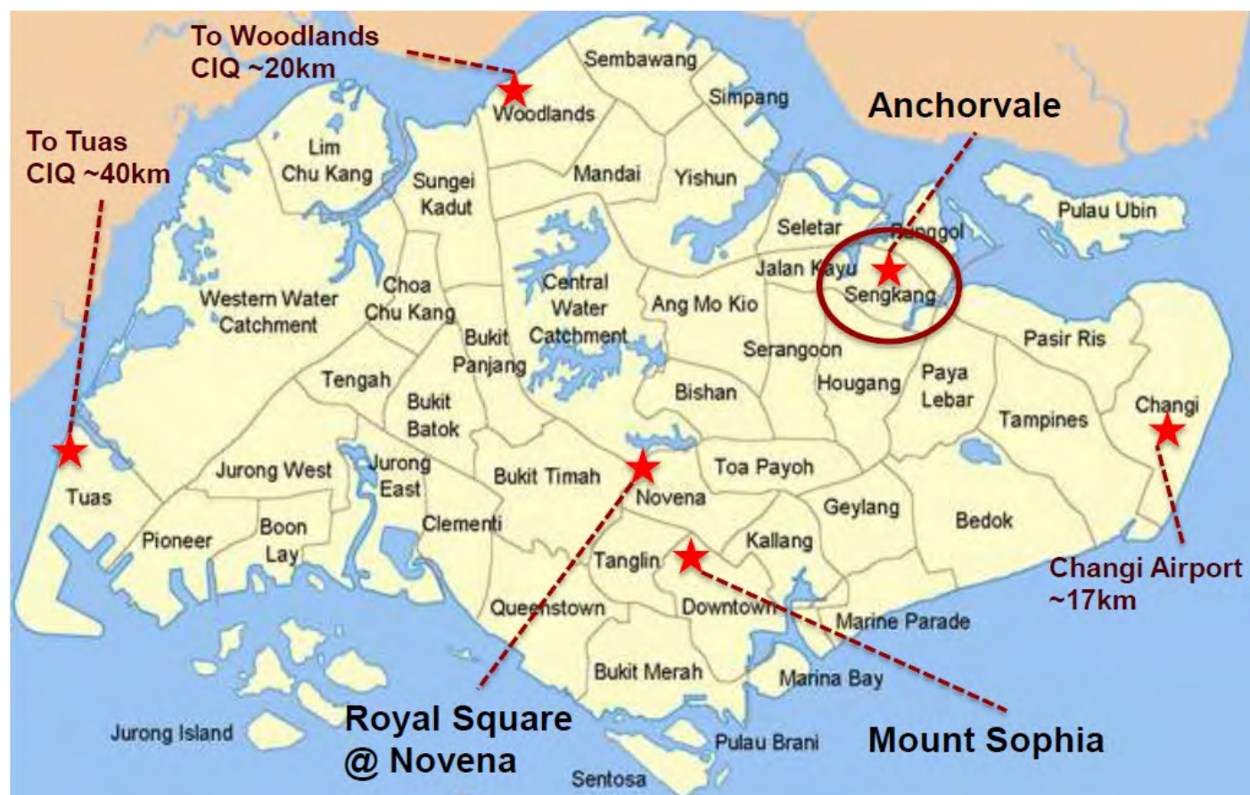
Figure 1: Location of land