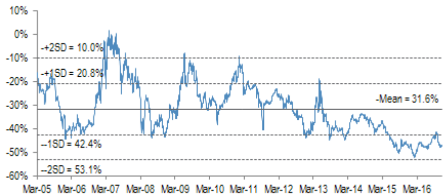
Figure 1: Developer RNAV band