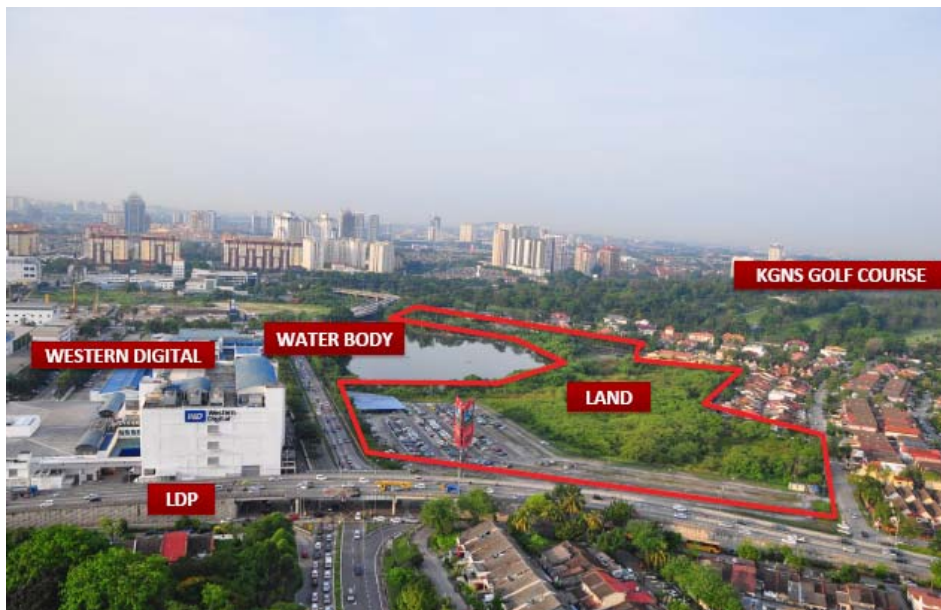
Fig. 2: Site photo