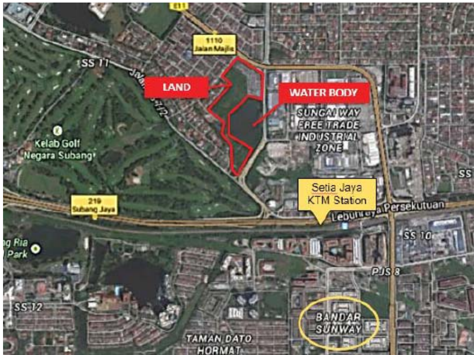
Fig. 1: Location of land