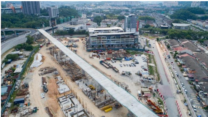
Figure 6: MRT2 Sri Damansara East Station (Jun 2018)