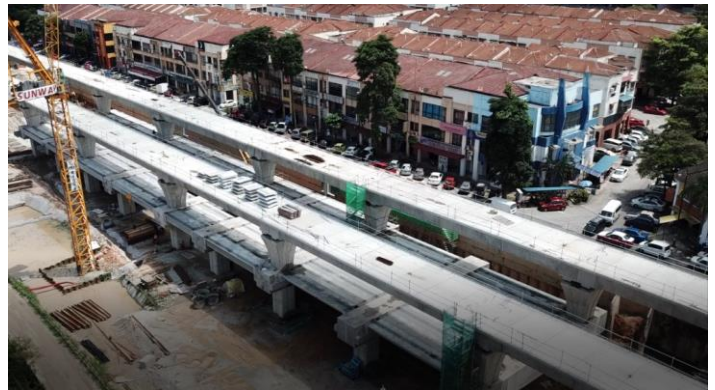
Figure 5: MRT2 Damansara Damai Station (Oct 2018)