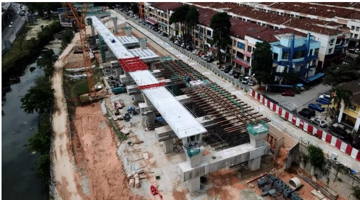
Figure 4: MRT2 Damansara Damai Station (Jun 2018)