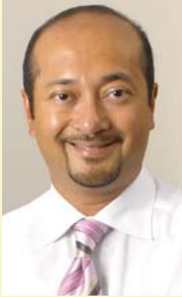
DATO' MUKHRIZ MAHATHIR Chairman/Managing Director