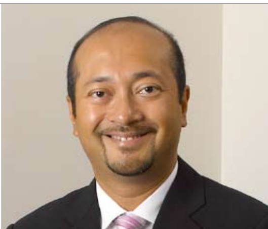
Dato' Mukhriz Mahathir Chairman/ Managing Director