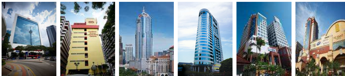
Bangunan AmBank Group ('BAG') AmBank Group Leadership Centre ('AGLC') Menara AmBank ('MAB') Menara AmFIRST ('M.AmFIRST') Kelana Brem Towers ('KBT') The Summit Subang USJ ('Summit')